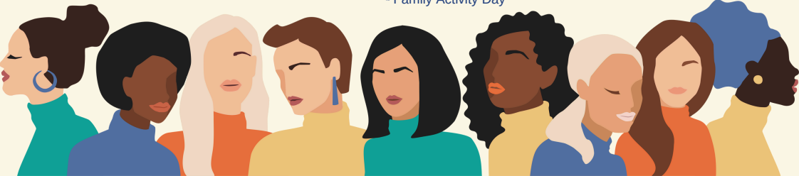
Family Activity Day