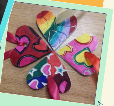
Co-production Board Awareness & Resilience Project