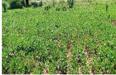
In the part cultivated, individual staff is allocated a portion of land to plan beans. The above is one garden with beans