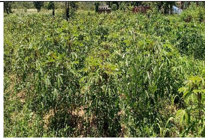
Plantation of cassava. When this cassava matures it will help improve the feeding of the student and staff especially breakfast.