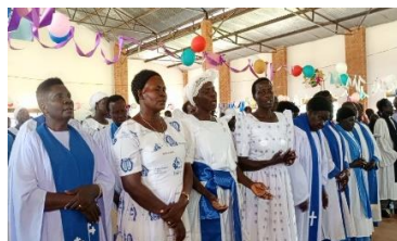
The same congregation on the enthronement date at Emmanuel Cathedral in Ramogi ECSS Mission area. The see of the Episcopal Diocese of KajoKeji