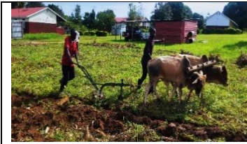
Part funds for support of Agriculture project included purchase of the Ox-plough on the picture, under training within the college premises.