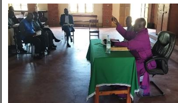
Pastors retreat for preparing the clergy for the searching for and nomination of persons for election for a Diocesan Bishop for the Diocese of KajoKeji