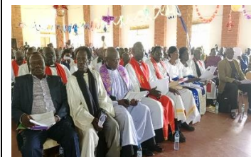
A congregation of over 3000 people- clergy and laity on 16 th -Sept. 2013 during enthronement. College contributed cash 1,000,000 and the transport services with your support.