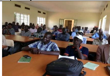
The congregation that witnessed the official handing over comprising of Board members, Diocesan Head of Department, NGO leaders, elders and local leaders from the community.