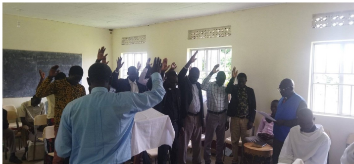
The Student leaders taking their oath to serve the college.

He encourages the guild leadership to work hard in their various roles.