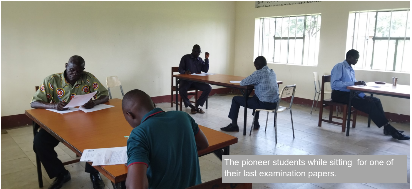
The pioneer students while sitting for one of their last examination papers.

The first batch of students pursuing Bachelor of Theology Degree at The Episcopal University of South Sudan, Kajo-Keji Christian College Campus has finally sat for the last examinations.