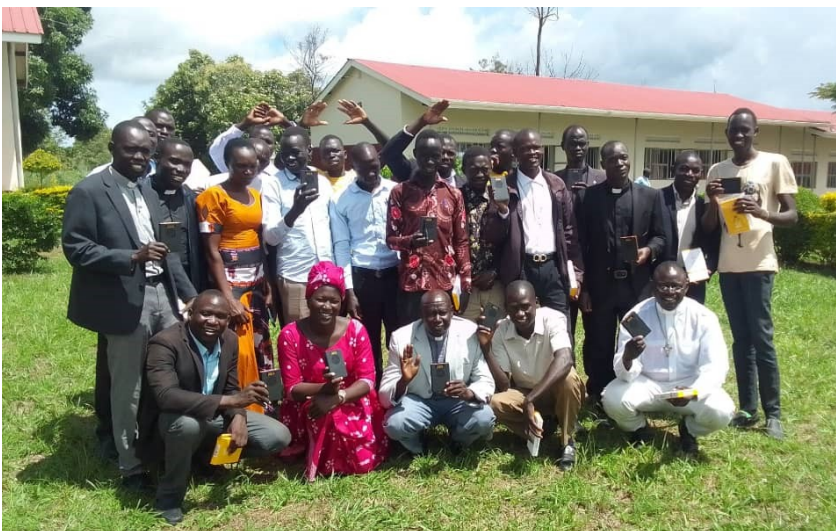
A group photo of club members after receiving their audio Bibles

The college believes that the ABBC will create a nurturing environment for students and the community to listen, learn, and grow in their faith. By gathering men, women, children, and even foreigners residing on our campus, we will foster a sense of community as we journey together through the Word of God.