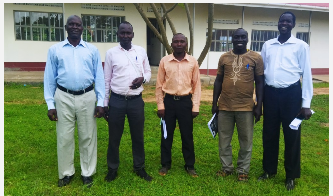
Some of the pioneer students take a memorable photo after finishing their exams.

He says he is ready to serve his community with the knowledge and skills he has gotten during the studies.