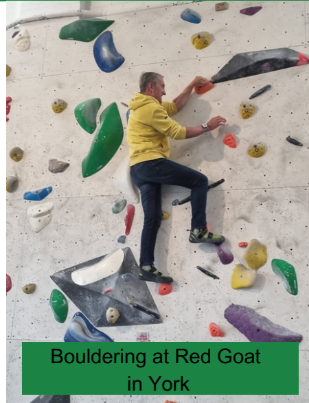
Bouldering at Red Goat in York