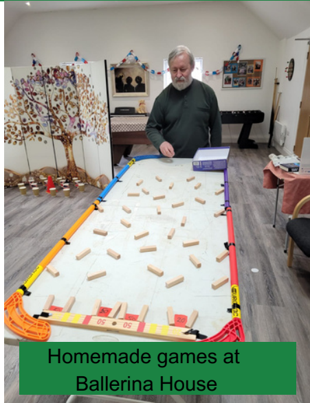
Homemade games at Ballerina House