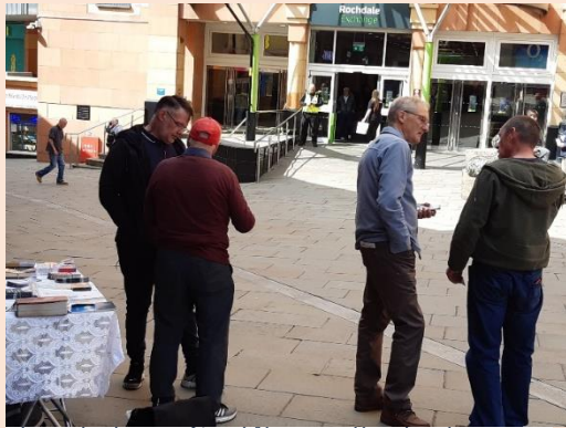
Prineds sharing Good News on the street.

It rained a lot in the months of March and April which has often obstructed our Street Evangelism task. but these days it has been clearer and much warmer comparatively.